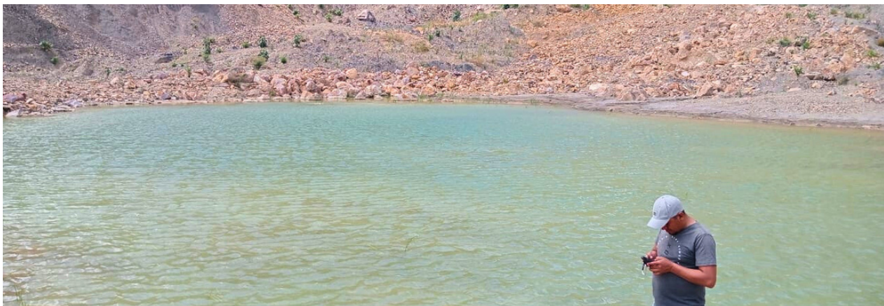
Inventory of water resources for industrial use in the Don Gregorio drilling project, baseline of the Environmental Technical Data Sheet (FTA). Water source in the Mochica sector, August 2023.

Should our exploration activities necessitate increased water use, we will comply with all relevant regulations and obtain the necessary water-use permits from the Ministry of Agriculture. However, our current stage of operations, characterized by limited water use and small team size, ensures a minimal impact on water resources in our operational areas.