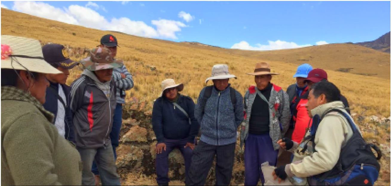
Explanation of the components in the field work to members of the Pucarini project, negotiation committee.