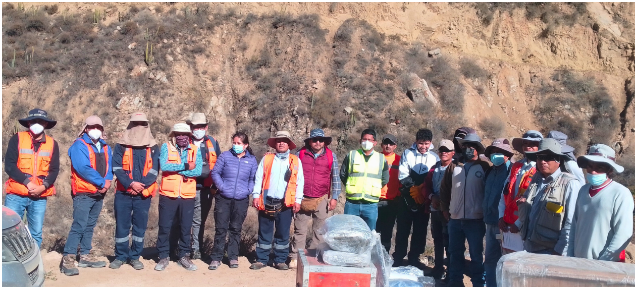
Participants on the Base Line Study (DIA). Team of GEADES CONSULTANT S.A.C (Environmental Group), AMARU RESOURCES Social Consultants and community members from Ispacas Community. December 2021.