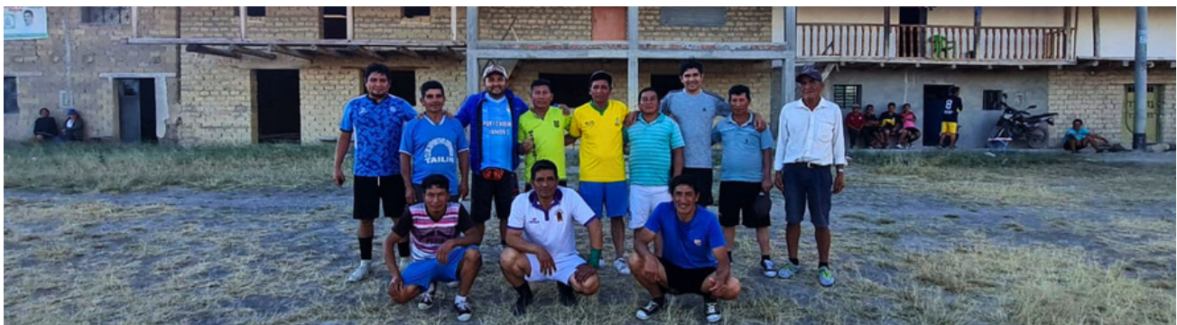
Closing of an Information workshop. Soccer event participants: Social team of FORTE COBRE with “ronderos” on the anniversary celebration of Tailin Town, Sallique District. June. 2023.