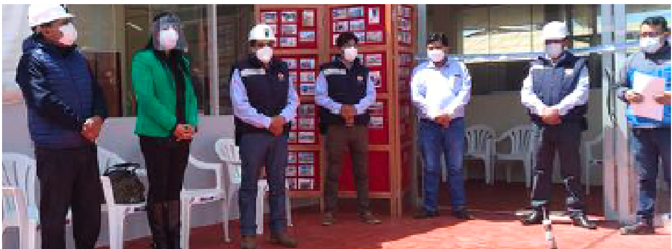
Coordination meeting with DREM PUNO, to organize the citizen participation process for the evaluation of the DIA (Environmental Impact Declaration) of the Pucarini project .

We are determined to adopt a transparent and inclusive approach to understanding the material issues that affect our stakeholders. This method is pivotal in guiding our strategic direction, informing our decision-making process, and generating tangible value for our stakeholders and the communities in which we operate. The materiality assessment will commence following the completion of our ESG framework, cementing our commitment to responsive and responsible business practices.