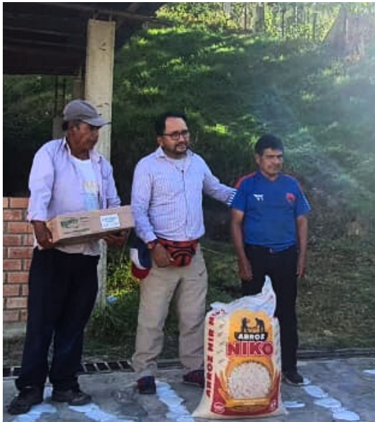
Delivery of support requested to FORTE COBRE S.A.C by the Educational Institution of the Català farmhouse, Sallique District. June 2023.